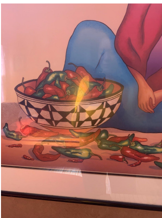
Chilli peppers in a painting

If you don't have access to a camera, describe four to eight items on a piece of paper.