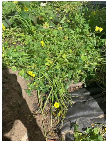
sourgrass in backyard