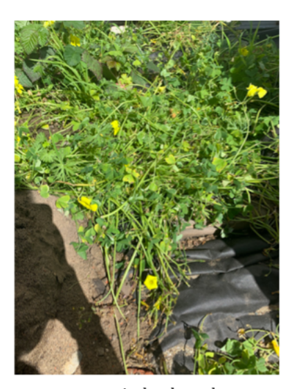
sourgrass in backyard