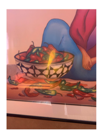
Chilli peppers in a painting s Images 1-3: examples of photos

If you don't have access to a camera, describe four to eight items on a piece of paper.